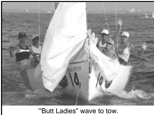
"Butt Ladies" wave to tow.

The boat's name poses a fashion question. Their superb sailing gives the answer. "No."